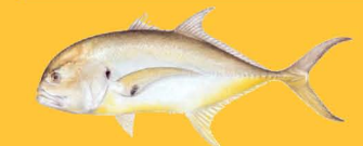
Caranx hippos* Creville Jack