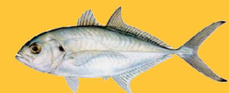
Caranx crysos Hardnose (Blue Runner)