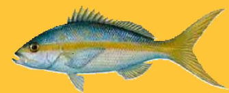
Ocyurus chrysurus Yellowtail Snapper*