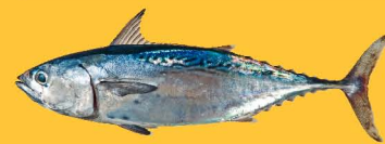
Euthynnus cavalla Bonito (Little Tunny)